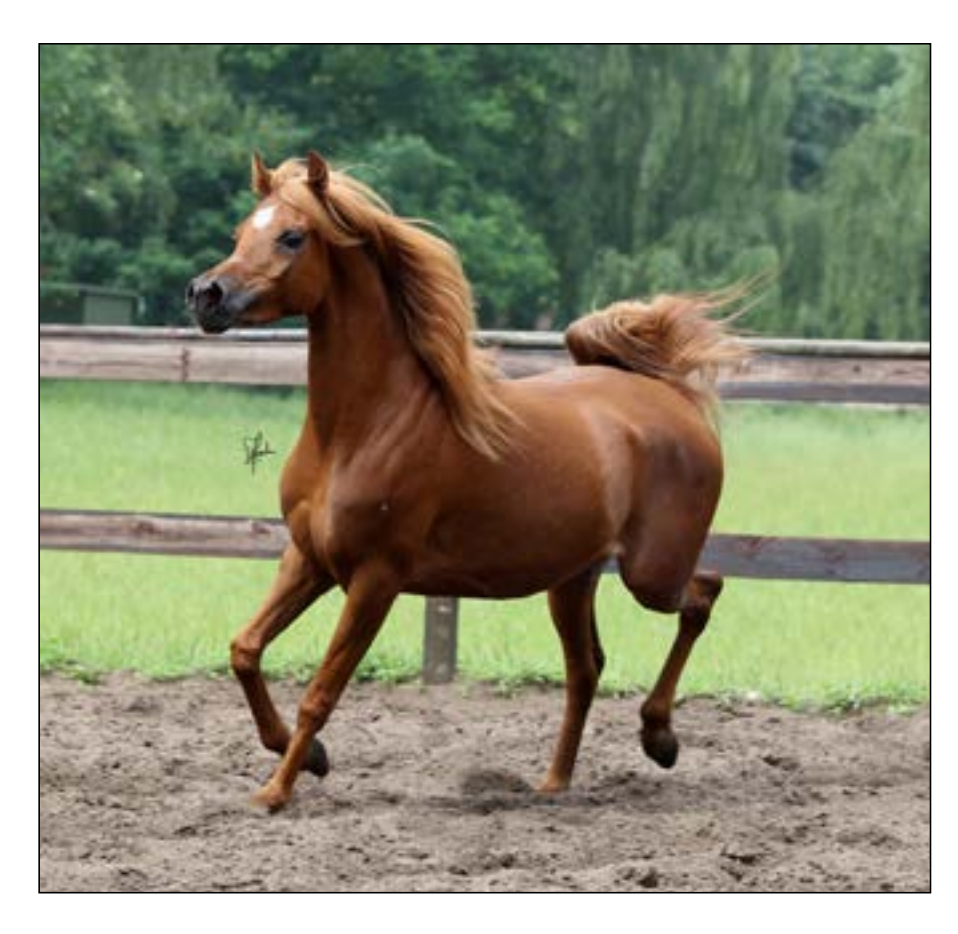
NK Nina (NK Nadeer x NK Bint Nashua)

showed up were the same old shortages and problems that had been known from before, existing in the historical gene pool and forcing man to deal with them from time to time.