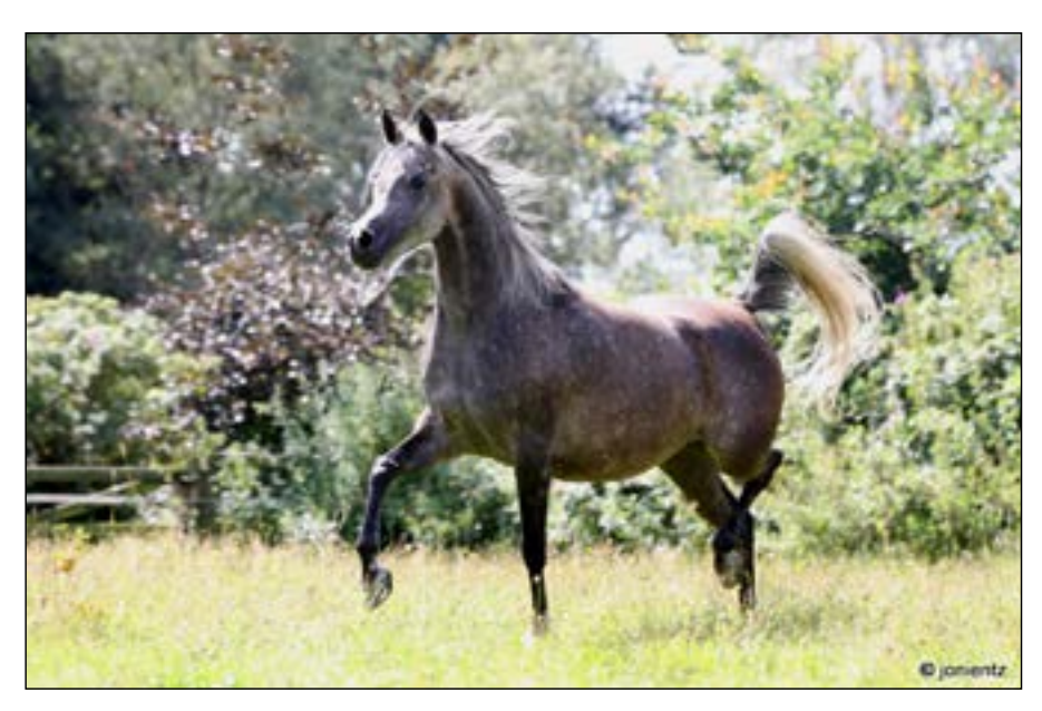
NK Habiba (NK Nadeer x NK Ansata Ken Ranya)