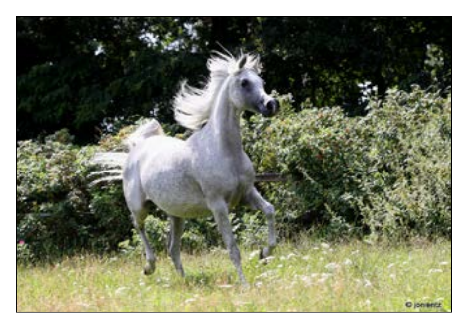
NK Lubna (Jamal El Dine x NK Layla)