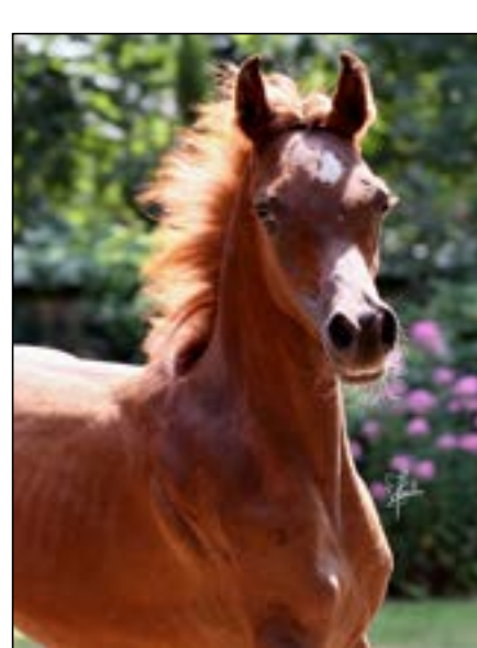
Arabian Stallions (4) of the World XVI—