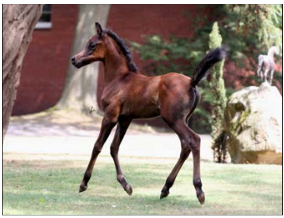
NK Housam El Dine NK Nabhan x NK Habiba)

could conclude such requirements. In the following 15 years, these horses and their offspring were closely examined in my own stud, and finally the decision was taken to bring only four rootmares and their offspring into such a close program, along with those stallions which were related to these four families and which had been tested at the same time, ensuring that all of them were free of unwanted features.