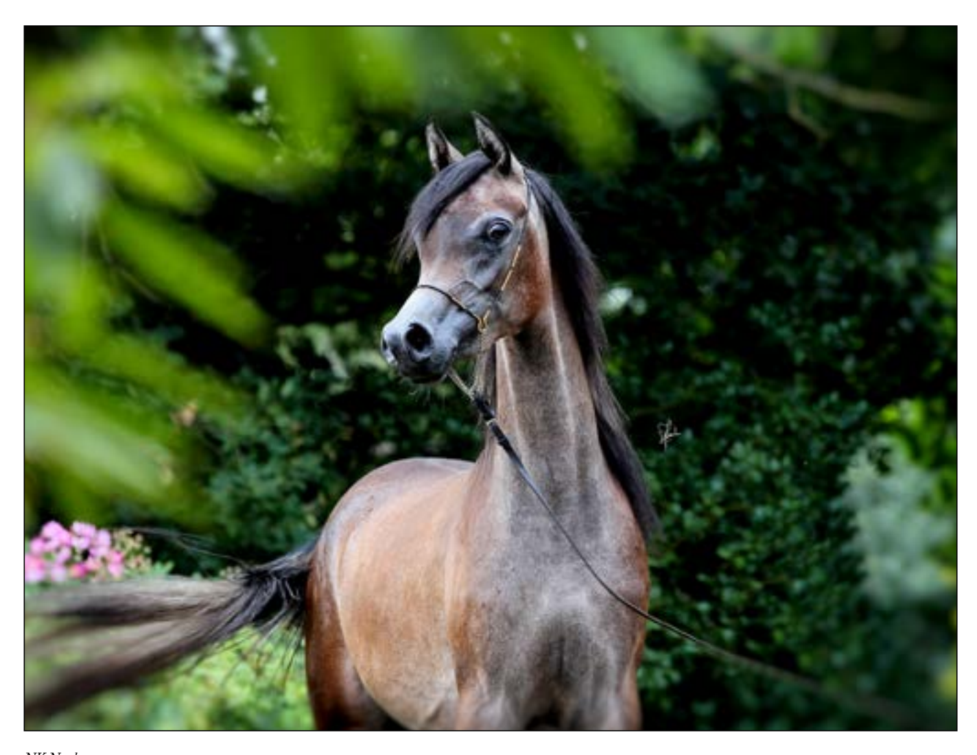
NK Naala (NK Nabhan x NK Nadirah)

eliminate it within one generation by removing the carriers from breeding. All of my horses are free until today