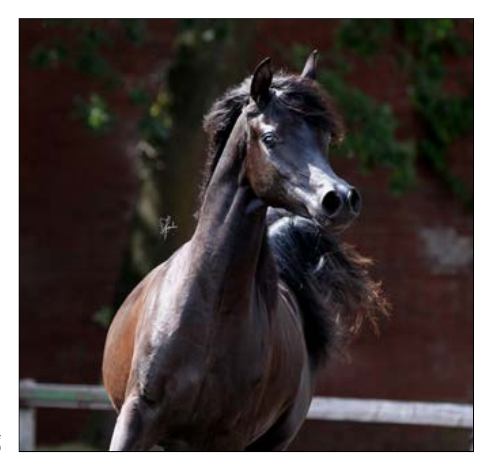
NK Naya (NK Nabhan x NK Nina)