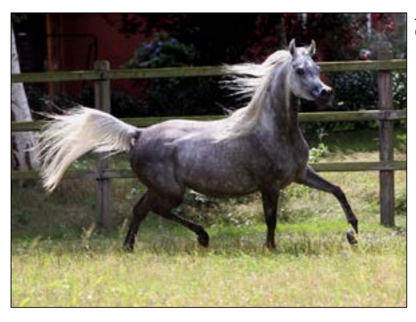
NK Nachita (NK Nadeer x Bint Bint Nashua)