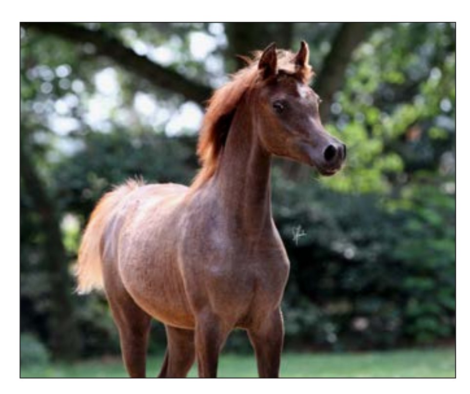
NK Najdiyah (NK Nabhan x NK Nakibiah)