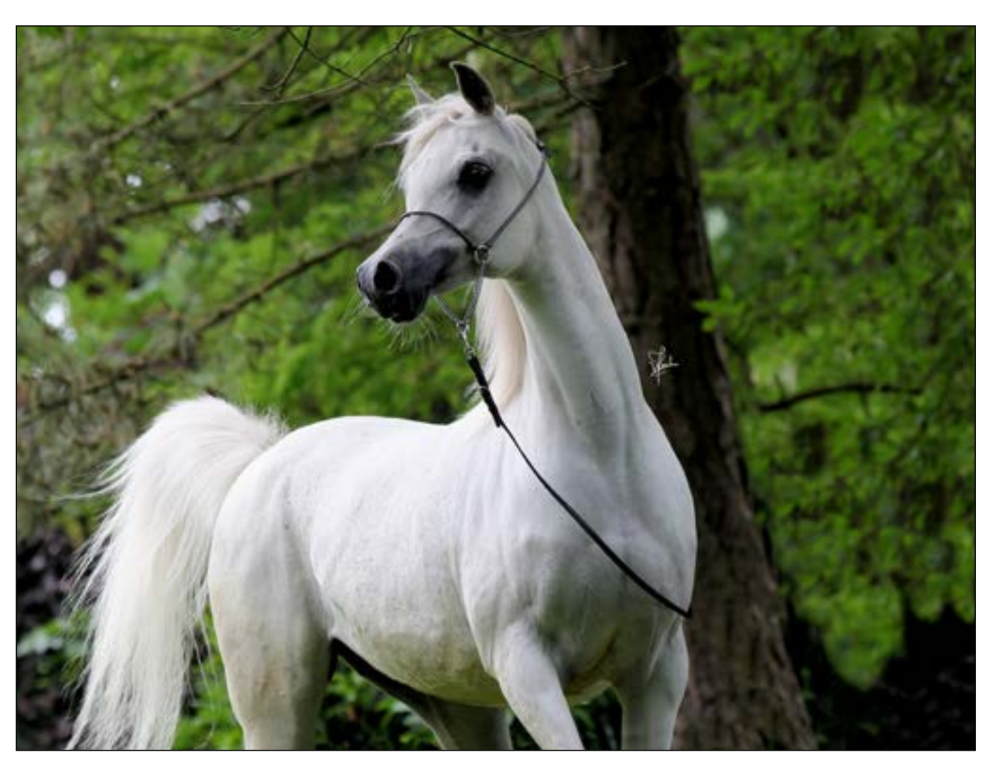
NK Nadirah (Adnan x Nashua)

in all in line with the clear increase in the established in-breeding index calculation which is commonly applied and used as a base of discussion in this respect.