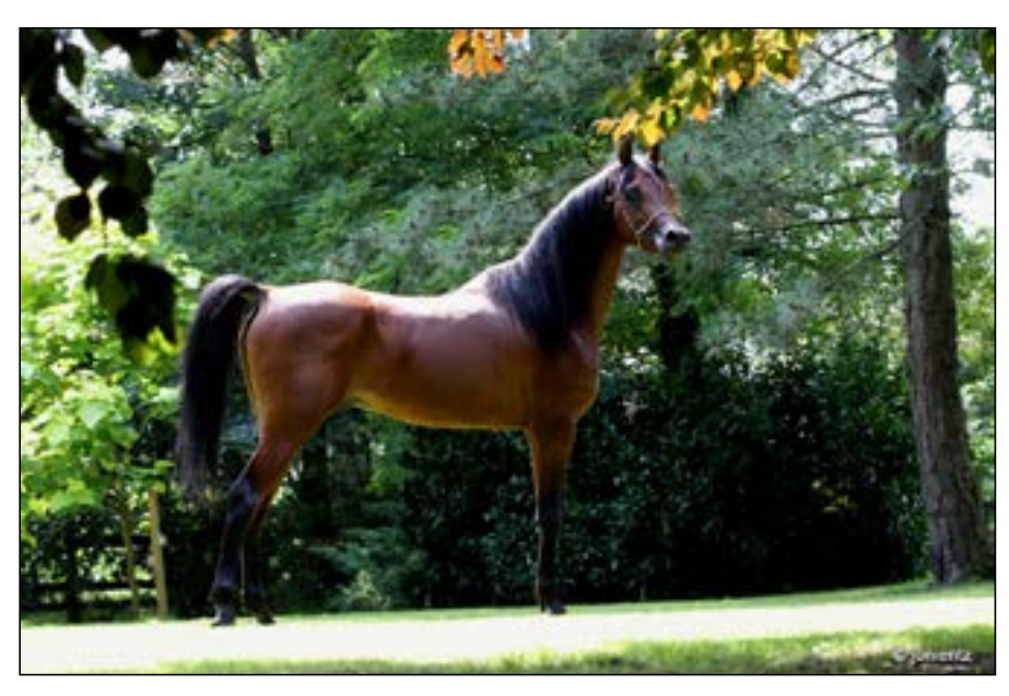
NK Nabhan (NK Nadeer x NK Nerham)

his creative ideas into practice. Among them are alternative ways of presenting Arabian breeding stock, far removed from those shows that project horses into an artificial high-end world. Open House events, presenting horses in family groups as well as stallions with their offspring, have been an alternative for some time. These are presentations that are based on a didactic concept, which makes it possible to present horses even without show training, as there is a relaxed atmosphere and their beauty and Arabian charisma will not fail to enchant the spectators.