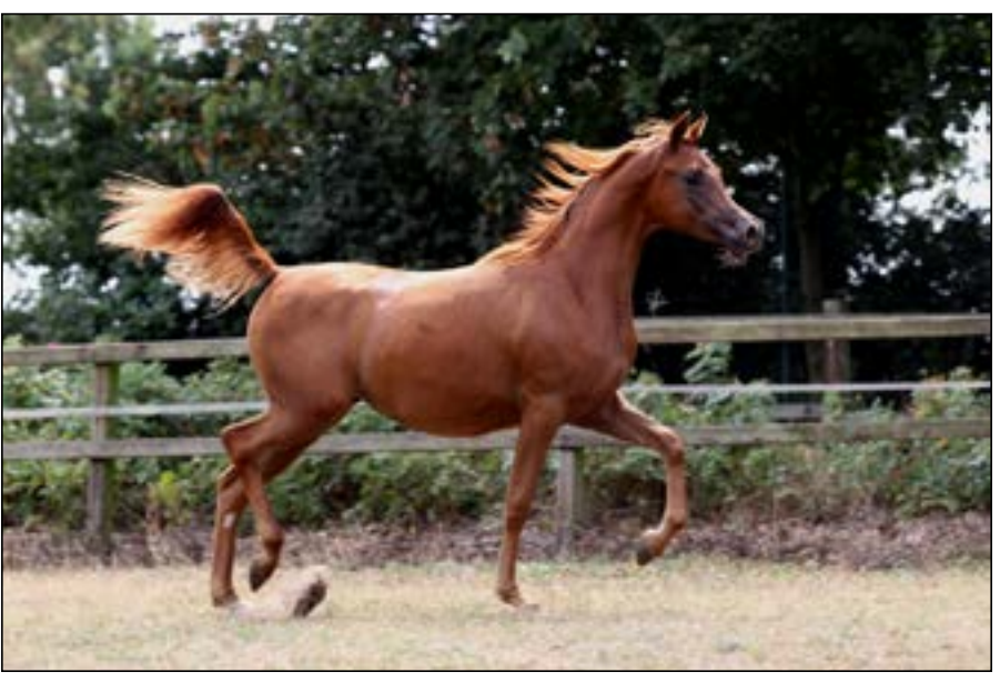
NK Lamya (NK Nabhan x NK Lubna)

Savier: You said you assumed that one day, the stallions you needed would show up in your program. Which are these stallions?