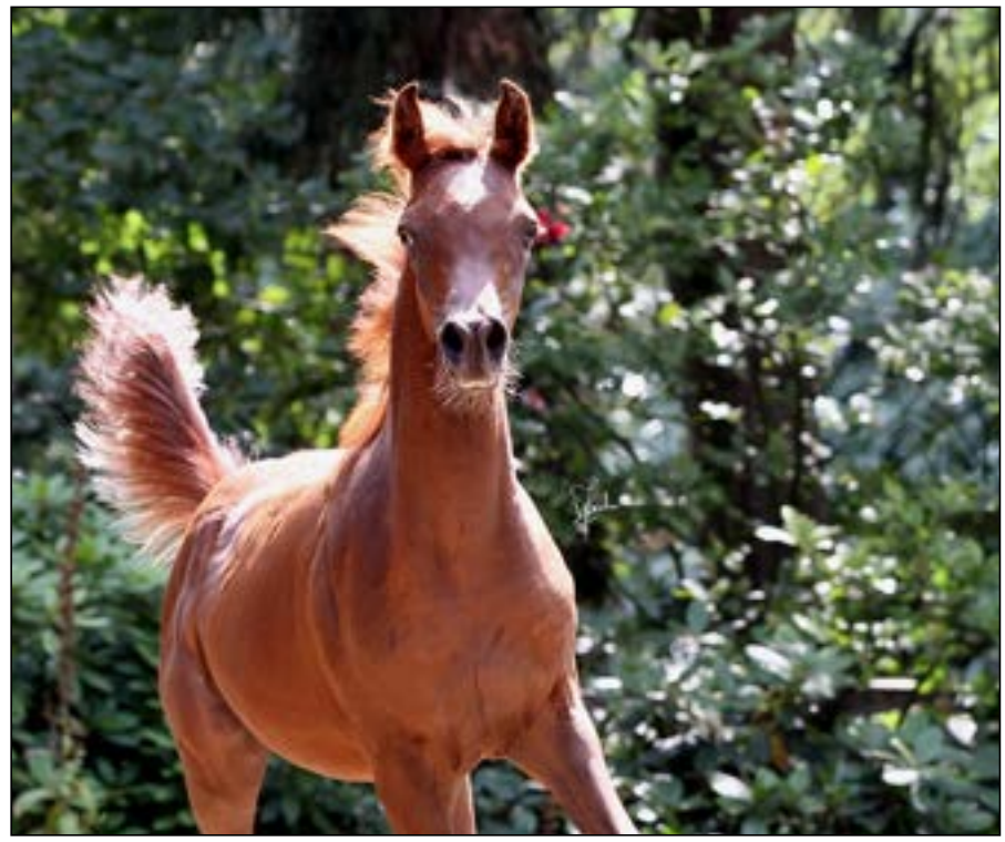
NK Lam El Dine (NK Nabhan x NK Lina)

make-up. In so far it looks like these Arabian horses, or to put it better: this specific population is highly resistant to in-breeding, and history and the arguing of so many connoisseurs of the Arabian horse as the oldest unique breed are