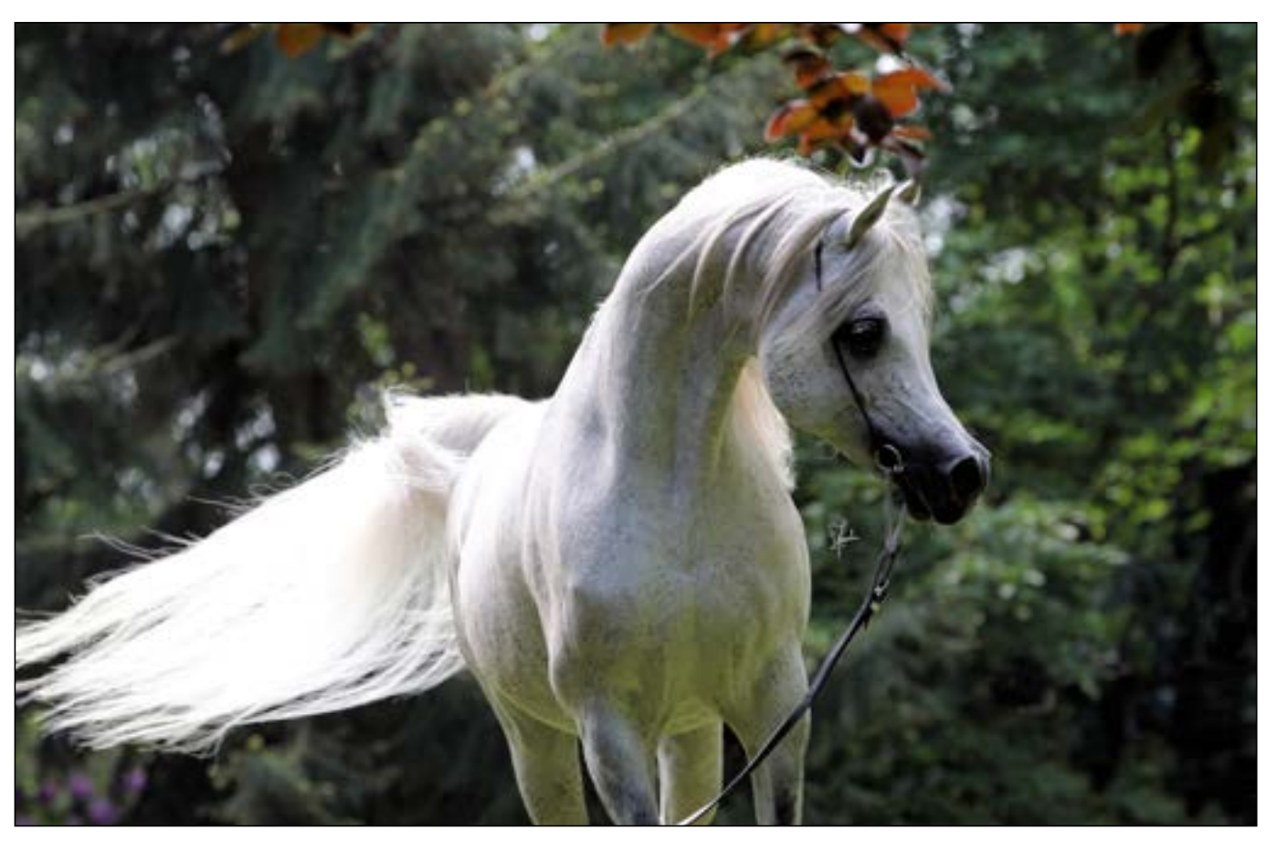
NK Nadeer (NK Hafid Jamil x NK Nadirah)

time in the Arab countries in the North along the big rivers as in Syria and Iraq. These small groups were bred to each other and when, due to this close breeding, faults and weaknesses appeared, natural selection took place and eliminated those weaknesses immediately. In consequence, the true Arabian is a product of severe natural selection as the decisive factor. The human influence is second to that, it is even very weak. A Bedouin had to accept that he had very limited control. The only thing that was left for him after such merciless natural selection was a certain choice.