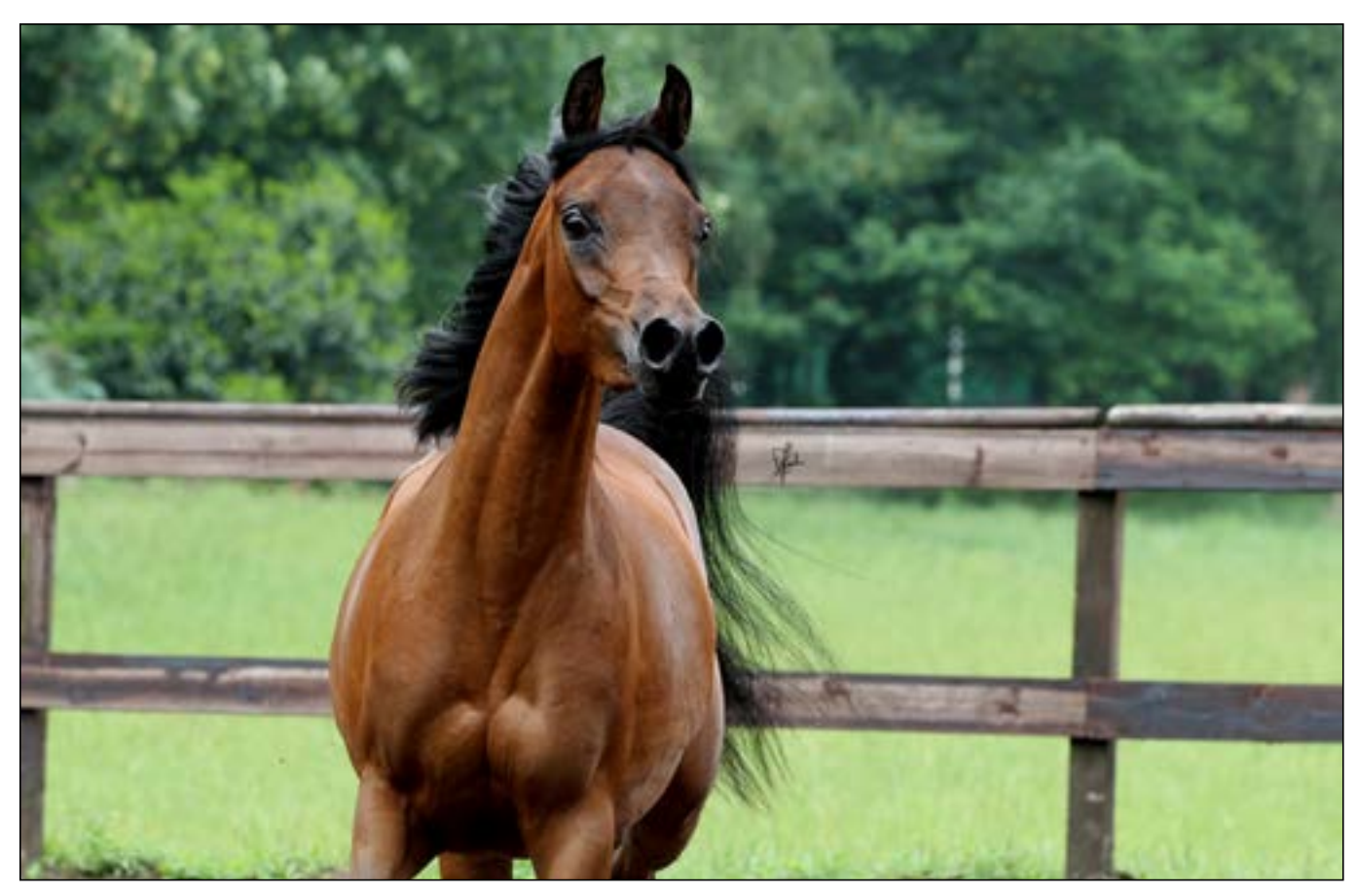
NK Nabhan (NK Nadeer x NK Nerham)